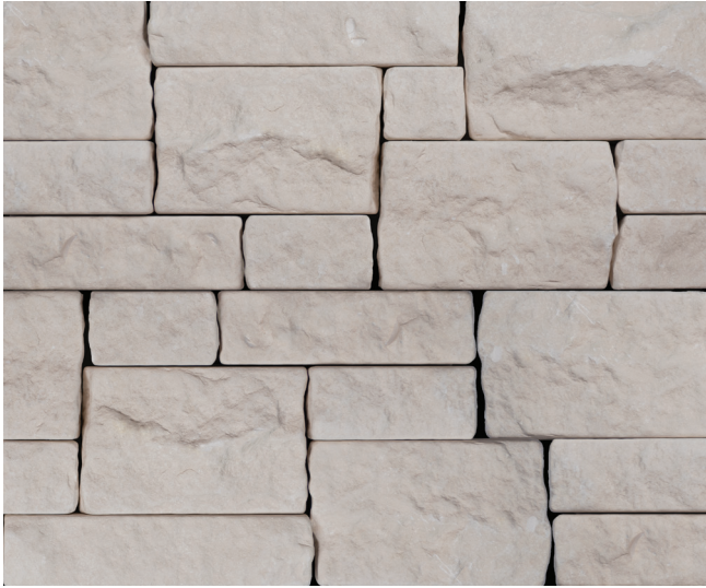
Light Beige 100006896 - 8"x22" Limestone Ledger - Tumbled