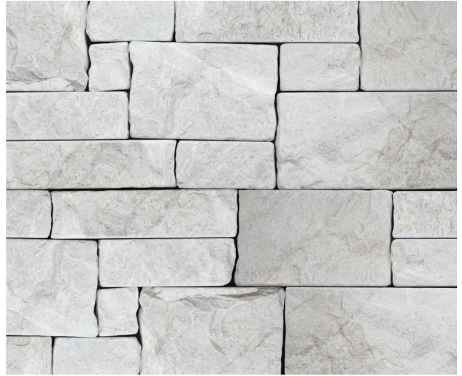
Taupe 100006898 - 8"x22" Marble Ledger - Tumbled