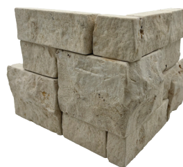
Mixed Beige and Grey 100006901 8"x18" Limestone Ledger Corner - Tumbled