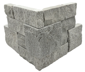
Grey 100006895 8"x18" Marble Ledger Corner - Tumbled