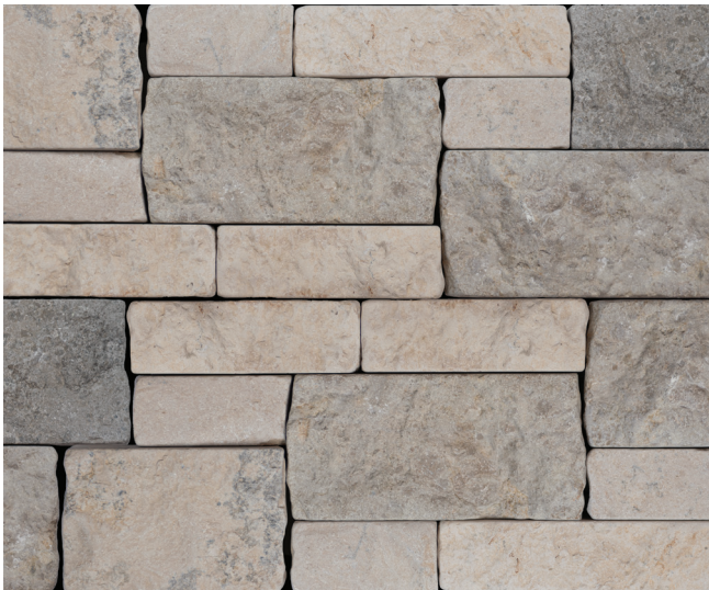
Mixed Beige and Grey 100006900 - 8"x22" Limestone Ledger - Tumbled