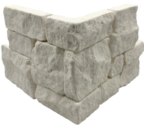
Light Beige 100006897 8"x18" Limestone Ledger Corner - Tumbled