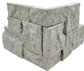
Taupe 100006899 8"x18" Limestone Ledger Corner - Tumbled