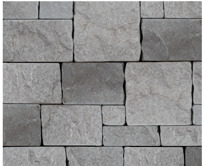
Grey 100006894 - 8"x22" Marble Ledger - Tumbled