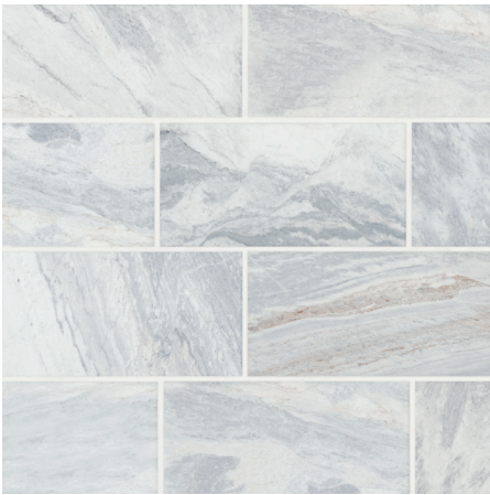
100003190 - 12"x24" Field Tile - Honed