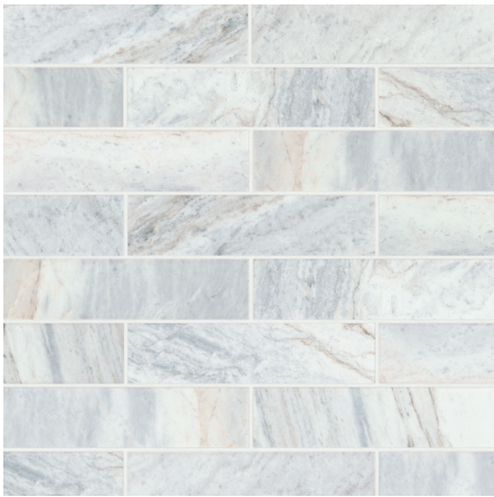
100003189 - 3"x12" Field Tile - Brushed