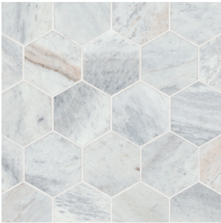
100003194 3" Hexagon Mosaic - Honed (12"x12" Sheet)