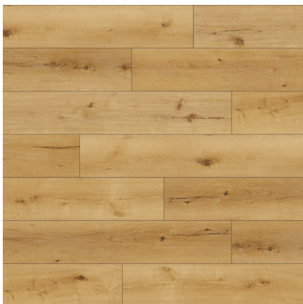
Honey 100006814 9"x60" Stone Polymer Composite Vinyl