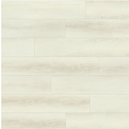
Fog 100007865 9"x60" Stone Polymer Composite Vinyl