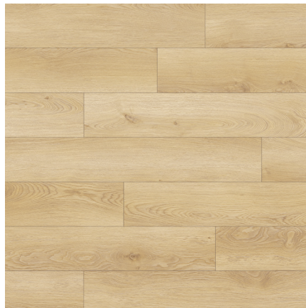
Linen 100006811 9"x60" Stone Polymer Composite Vinyl