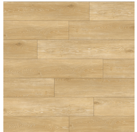
Canvas 100006812 9"x60" Stone Polymer Composite Vinyl