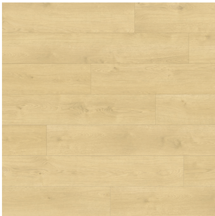
Khaki 100006810 9"x60" Stone Polymer Composite Vinyl