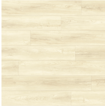
Crema 100006807 9"x60" Stone Polymer Composite Vinyl