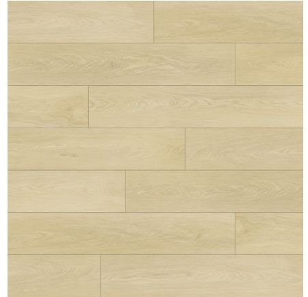
Sand 100006809 9"x60" Stone Polymer Composite Vinyl