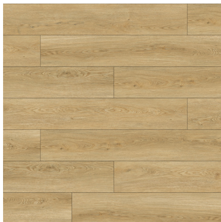
Oak 100006813 9"x60" Stone Polymer Composite Vinyl