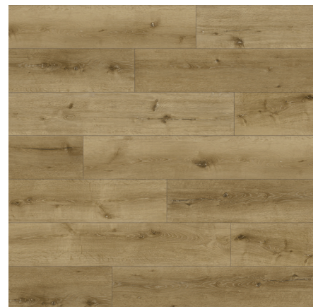
Driftwood 100006815 9"x60" Stone Polymer Composite Vinyl