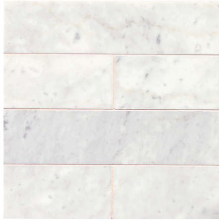
MRBWHTCAR0312H - 3"x12" Honed