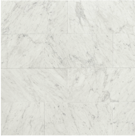
MRBWHTCAR1224H - 12"x24" Honed