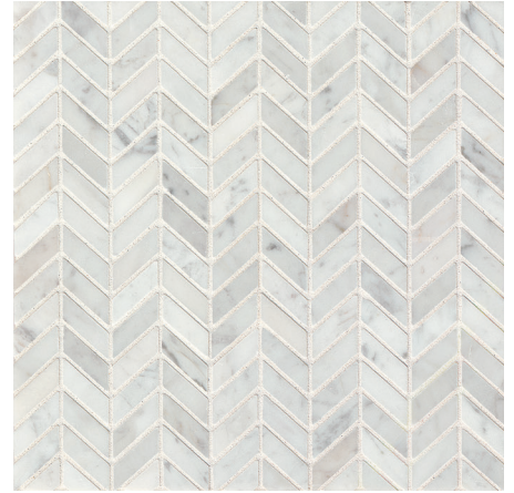
MRBWHTCARCHE-H Chevron Mosaic - Honed (12"x12" Sheet)