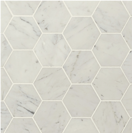
100007311 3" Hexagon Mosaic - Honed (12"x12" Sheet)