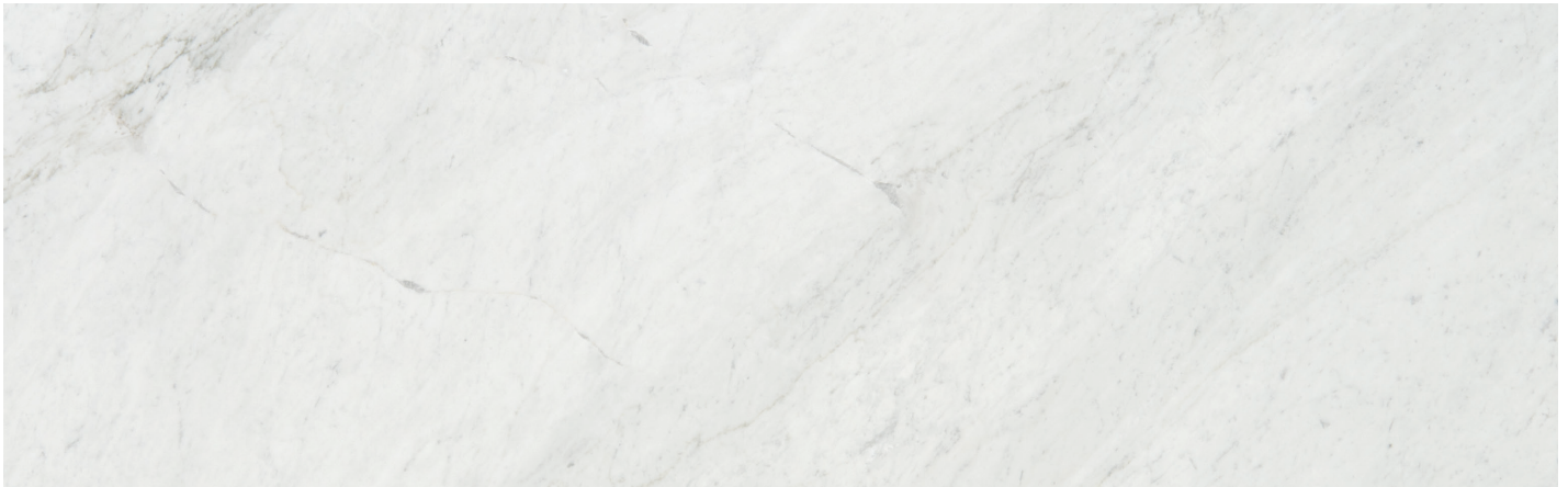
MRBWHTCARSLAB2P - 2 cm Slab Polished MRBWHTCAREXTSLAB2H - 2 cm Slab Extra Honed